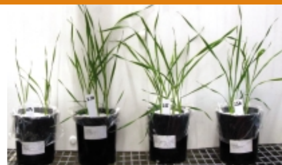
Shoot response of wheat to fluid fertilisers (APP and H 3 PO 4 ) compared to granular fertiliser (Triple P) and a control growing on a Vertosol collected from Minyip in the Wimmera under glasshouse conditions.

Granular fertiliser which dissolves and diffuses out of the granules quickly forms less soluble products